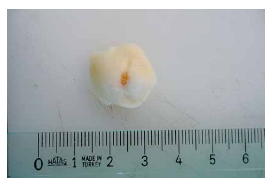
Figure 3. The wound excised with surrounding tissue and photographed for area measurement

four groups (Table II); however, angiogenesis was higher in all treatment groups compared to the control group, although the difference was not statistically significant (p = 0.65).