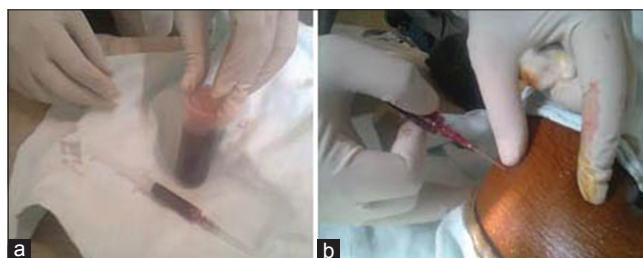
Figure 1: Preinjection photograph of blood sample technique (a) platelet rich plasma separated from vial (b) platelet rich plasma injection technique

There were 28 (71.79%) cases of subacute type and 11 (28.21%) were chronic cases in PRP group, whereas